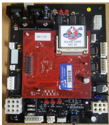
NS2234X with E2034XX